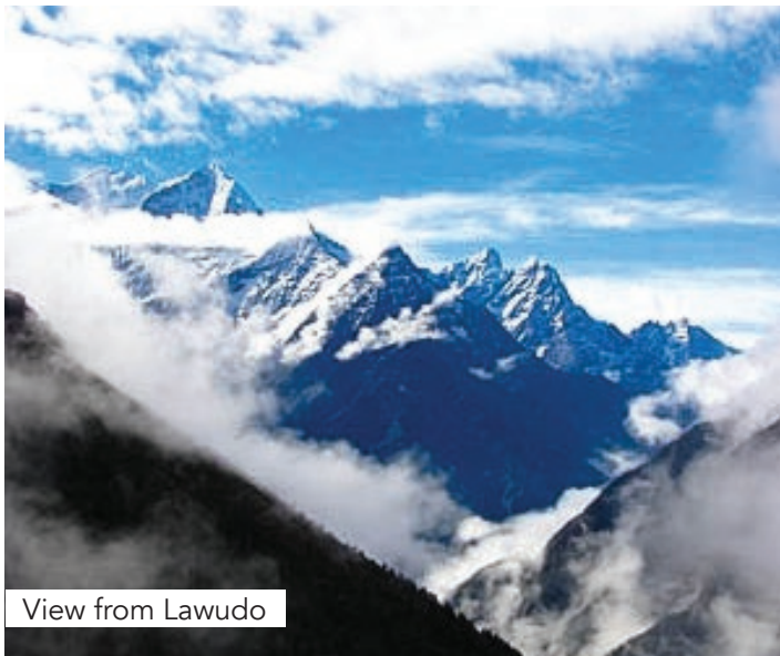
View from Lawudo