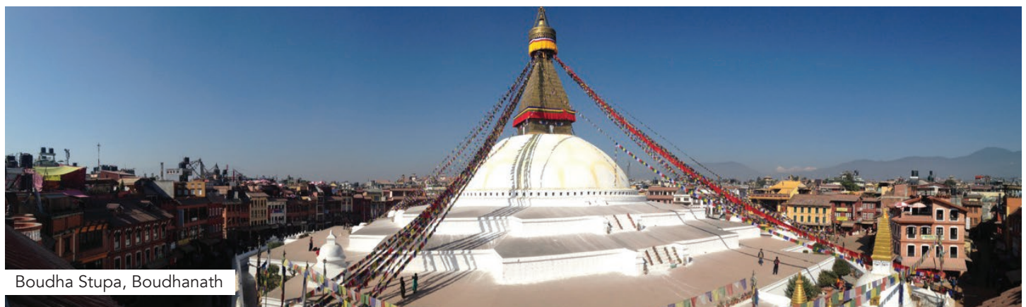
Boudha Stupa, Boudhanath

After lunch, you are free to relax in the afternoon.