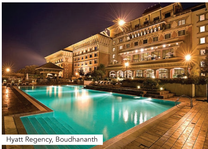
Hyatt Regency, Boudhananth

Relax today and explore Kathmandu, Boudha or surrounding districts.