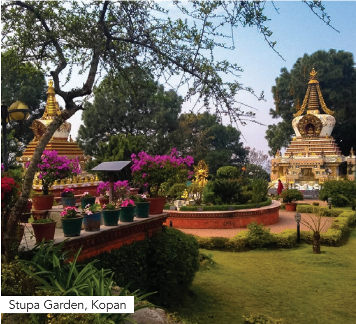
Stupa Garden, Kopan

If you haven't already arrived, we will pick you up at the airport and transfer you to Kopan.