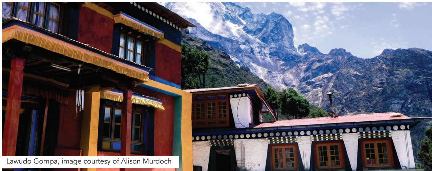
Lawudo Gompa