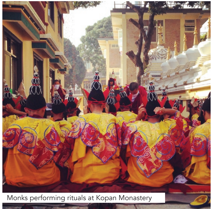
Monks performing rituals at Kopan Monastery

First we will spend two days at Kopan Monastery .