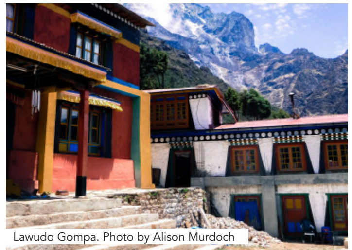
Lawudo Gompa.