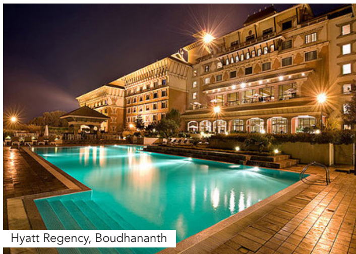
Hyatt Regency, Boudhanath

We can relax in the afternoon and evening.