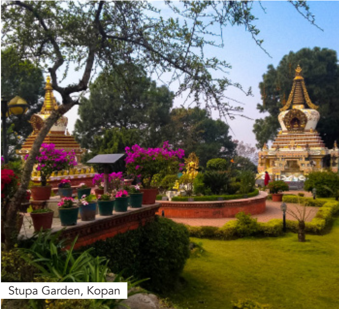
Stupa Garden, Kopan

If you haven't already arrived, we will pick you up at the airport and transfer you to Kopan.