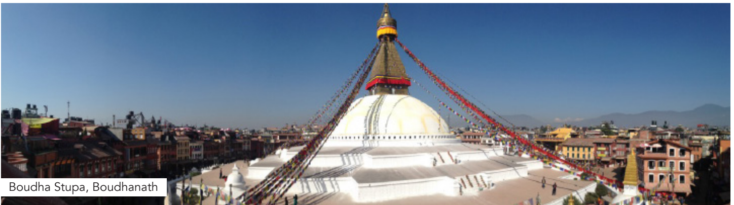
Boudha Stupa, Boudhanath

After lunch, you are free to relax in the afternoon.