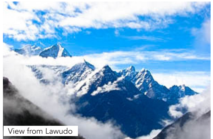
View from Lawudo